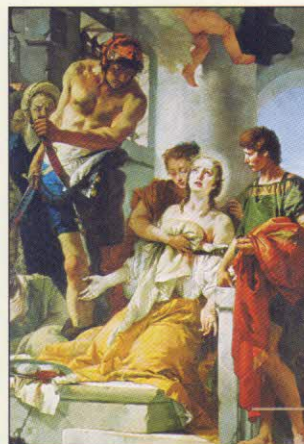
G.B. Tiepolo Martyrdom of St. Agatha (1735)

The Anthonian Museum offers a unique path among the artistic ‘treasures’ made through the centuries to adorn the Basilica and the Venerable Ark of Saint Anthony.