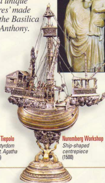
Nuremberg Workshop Ship-shaped centrepiece (1500)